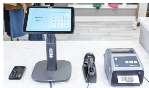
Agnostic POS Integration