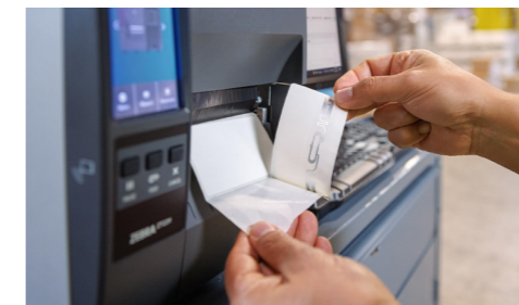
RFID Printing & Encoding